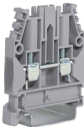
screw terminal block 1 level feed-through, 4 mm 2 , grey